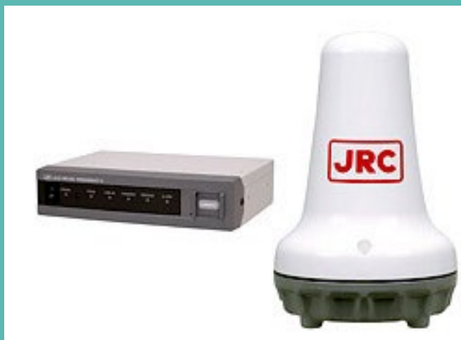
Example of an INMARSAT mobile terminal

INMARSAT is a two-way store and forward communication system transmitting messages from ship-to-shore and ship-to-ship. Its primary function is to share position data from fishing vessels. If you are unsure whether your boat has an INMARSAT mobile terminal, then it is most likely that your vessel is not equipped with it.